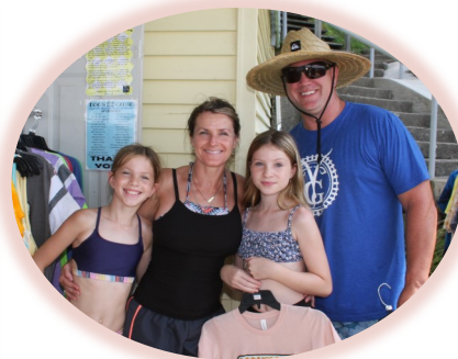
THE BALDWIN FAMILY