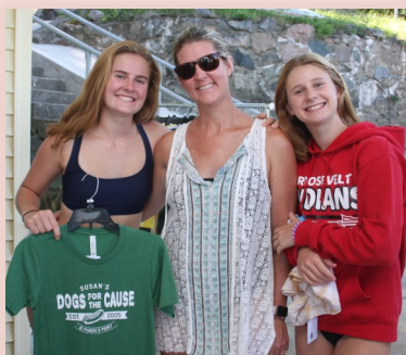
THE GRENNES FAMILY