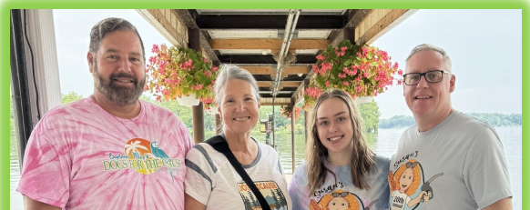
Our AMAZING Volunteers!