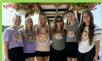
Freeman Bay Crew @ Last Year's Event