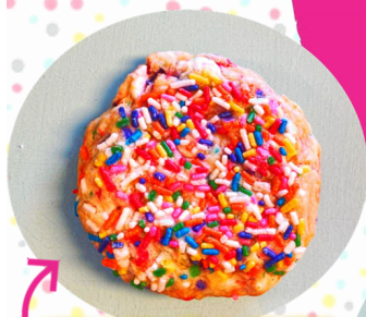
FUNFETTI BIRTHDAY cake