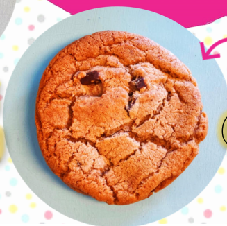
BROWN BUTTER CHOCOLATE CHUNK