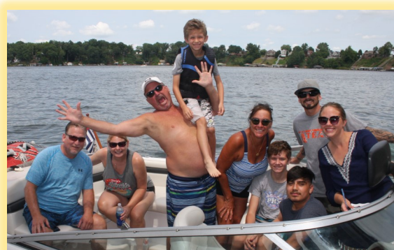
LAKEFREEMANLIFE.COM FRIENDS & FAMILY