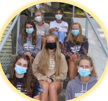
C R E W