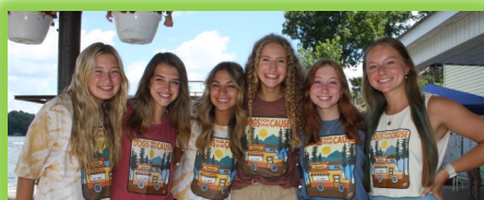
Freeman Bay Crew @ Last Year's Event