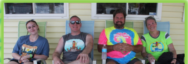
Our AMAZING Volunteers!