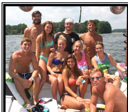
Eaton Family & Friends