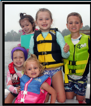
Hutton Kids & Friends